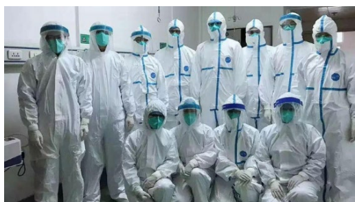
These bridge players wish to be safe.

We encourage the game of bridge in an environment where players compete and develop with enjoyment and mutual respect